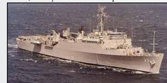
USS Monticello LSD-35