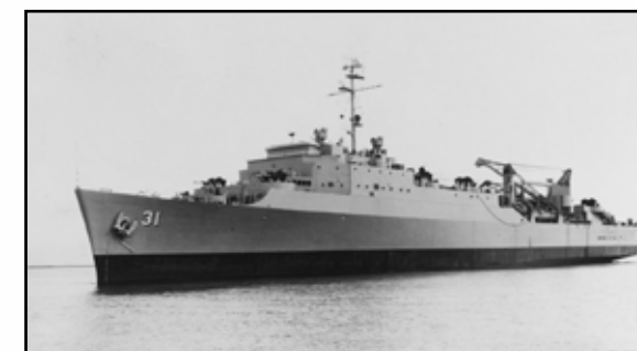
USS Point Defiance LSD-31

Replacements and new additions did not share our history. From then on it was just plain grunt work in an ever expanding war.