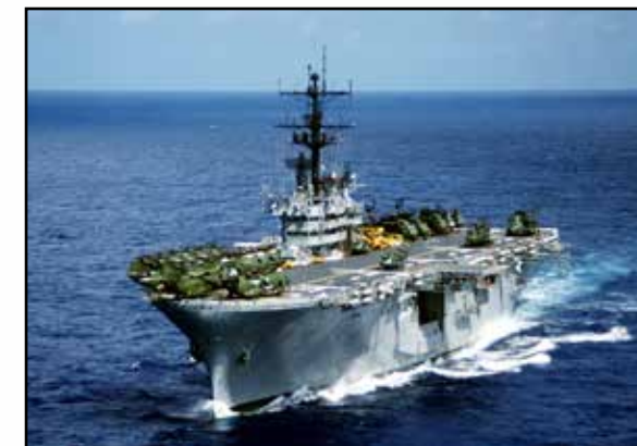
USS Iwo Jima LPH-2

Forge LPH8 with Fox and Golf companies aboard. After completing the last Dagger Thrust operation, 2/1 was unexpectedly committed to Operation Harvest Moon on December 10. It was a grueling and miserable operation that took place in the Que Son Valley between Da Nang and Chu Lai . 2/1's job was to enter and search the Phouc Ha Valley . While this was strictly