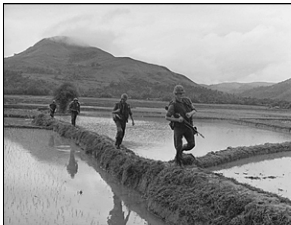
Operation Harvest Moon

leton . The mission was to land the company at night from a Navy ship,