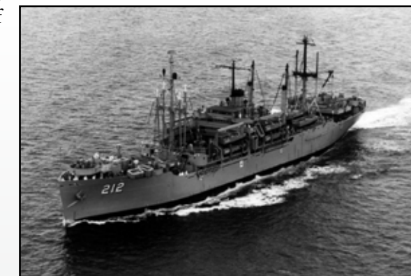
USS Montrose APA-212

It was my last memory to any reference to Echo company Raiders. After Harvest Moon, the battalion left the SLF and took over responsibility for the Phu Bai combat base . Some-time in January 1966 the makeup